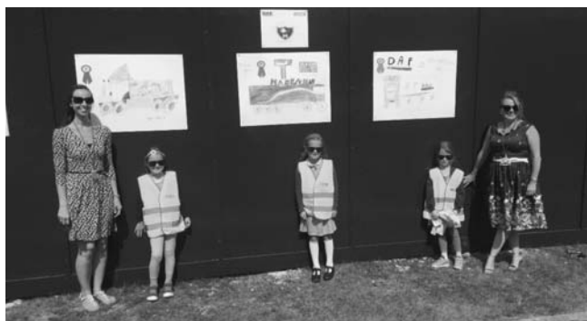
At the site for the new DAF