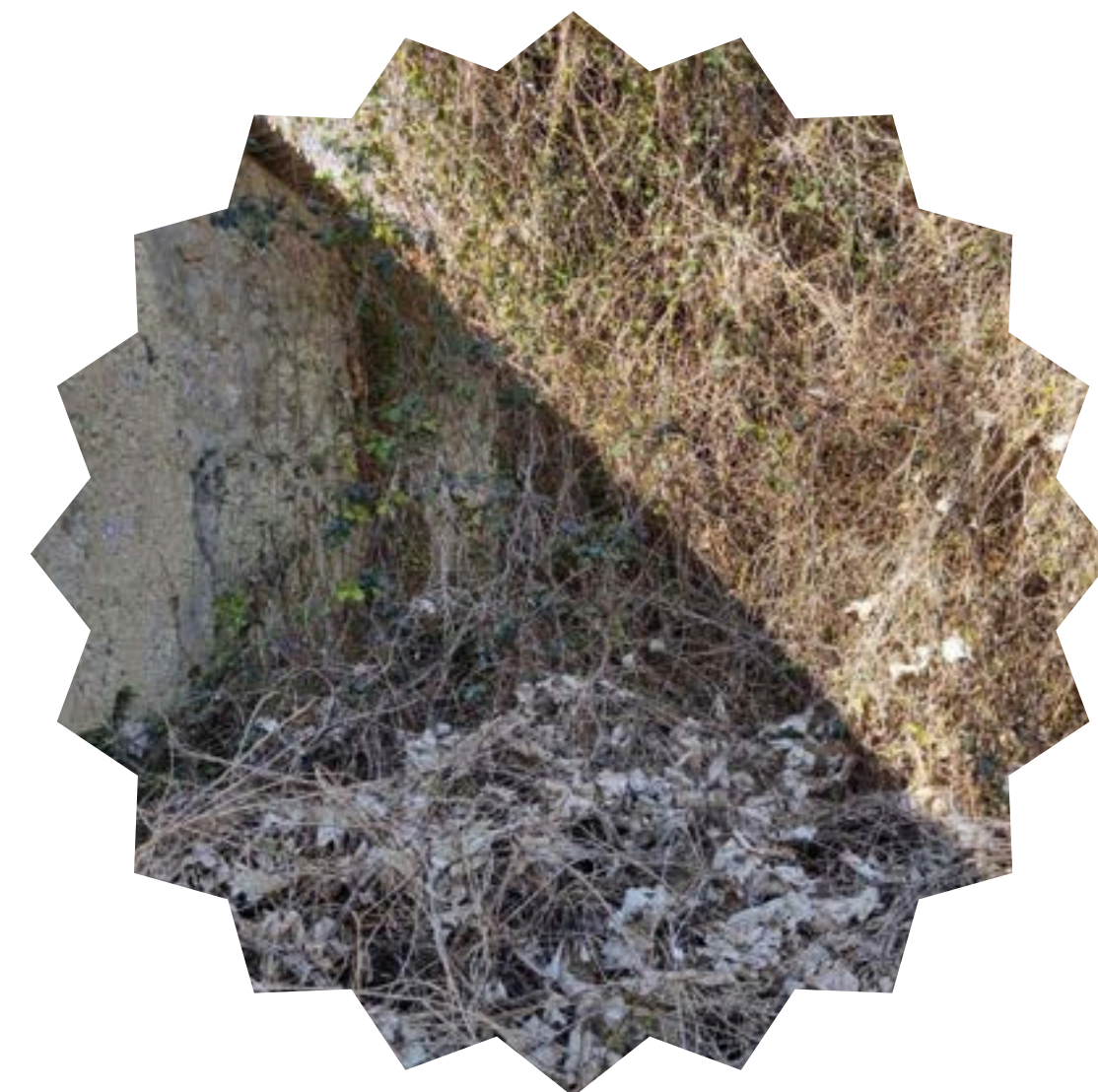
dumping of green waste & rubbish