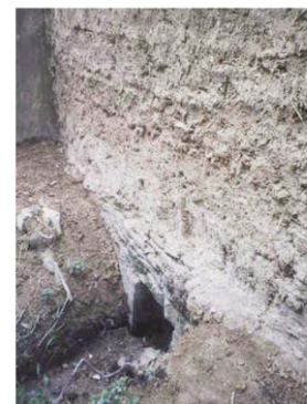
Newly rebuilt witchert wall over stream before trimming.