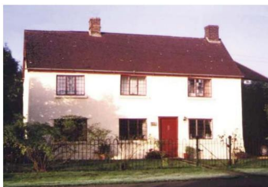
An early 19th century witchert house in Grendon Underwood, recently lime-rendered and lime washed after its pebble-dash had been removed.

Witchert or wychett, meaning white earth, is the name given to the local earth building material, known as cob in other parts of the country. It is found in a belt from the Oxfordshire border north-east through Long Crendon, Haddenham, Chearsley, Cuddington, Dinton, Stone to Aylesbury and beyond to Bierton. It also extends northwards to Ludgershall and in pockets up to Grendon Underwood and Twyford. The subsoil in these areas mainly consists of decayed Portland limestone and clay. When thoroughly mixed with water and chopped straw, it produces a walling material of high quality. Most were built in the 17th & 18th centuries, some as recently as 1920.