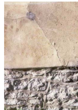
Cement mortar pointed grumplings and cement render. Cracks in both are drawing in water through capillary action. The moisture is unable to escape through dense render and cement mortar.

Because the use of dried witchert blocks avoids the problem of shrinkage this is one of the most straightforward repair methods. Small areas of hollows and depressions can be dubbed out with earth or lime mortar, having been cut back to sound material first. The new material must be allowed to set before a plaster or render is applied.