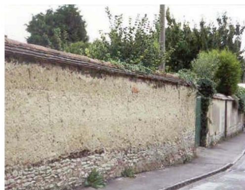
Witchert wall showing three berries above the grumplings. The coping is formed from plain and half round tiles.

The well-prepared witchert is put onto the stone foundation in layers, known as berries, of about 0.45 m (18") or more along its length and left to dry before the next berry is added. The sides are trimmed with a sharp spade. The walls may then be rendered for decorative purposes, but garden walls are usually left without a coating and do very well.