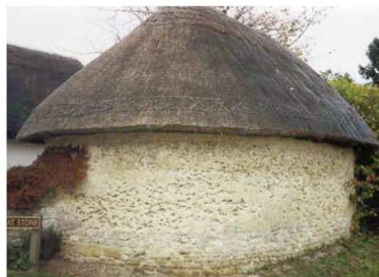
Small thatched witchert stable, the walls are pockmarked by masonry bees, but remain sound and dry under the overhanging thatch and above the unaltered stone plinth

'All an earth wall needs are good boots and a good hat to keep it dry' is a saying often quoted in literature on the subject of earth buildings. Unfortunately this simple rule worked well only until cement, modern plasters, renders and paints came on the market in the second half of the 20th century.